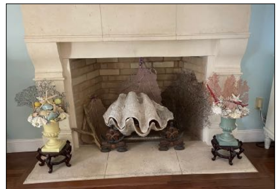
Brenda Hall collected shells from around the world and they are on display throughout the house