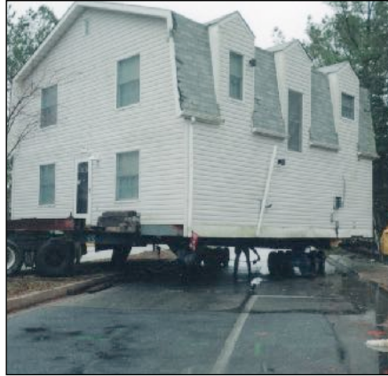
Brenda and Ray Hall's first house was moved to 142nd Street in 2003