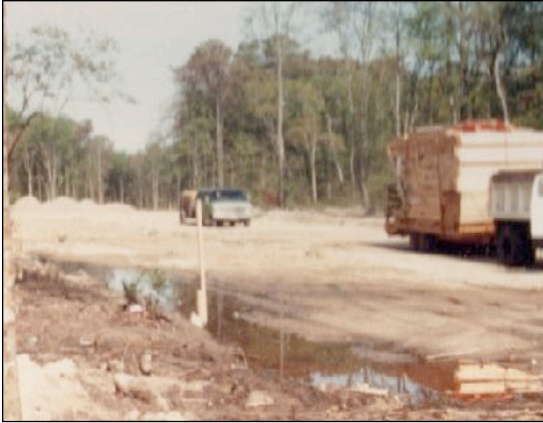
143rd Street in 1982 when construction supplies were delivered