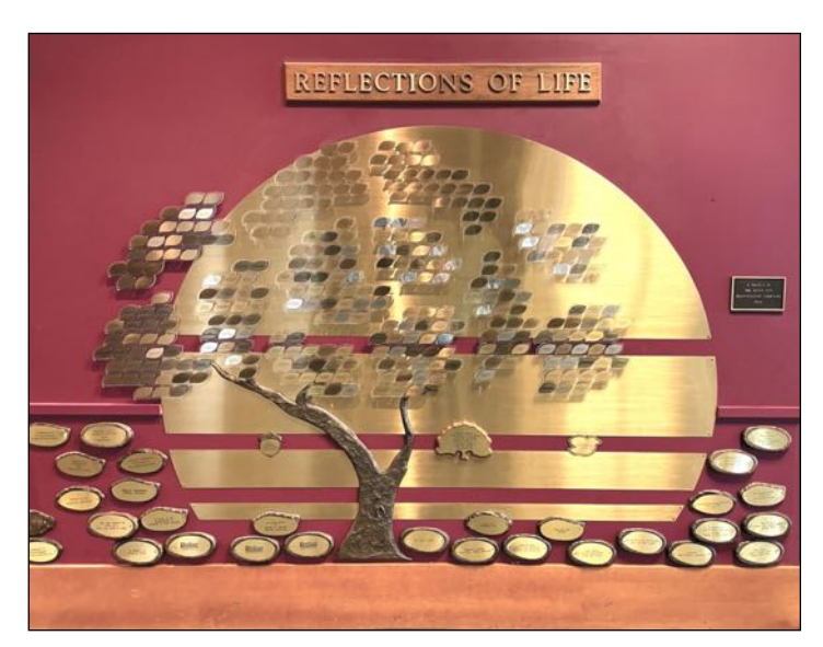
The Reflections of Life tree sculpture in the Ocean City Convention Center