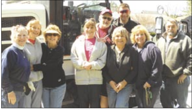
The clean-up crew

Caine Woods Association volunteers and Town of Ocean City employees teamed up at the annual Fiesta Park Clean-Up Saturday, April 13. The CWCA provided food and beverages to all workers. Thanks to all who participated!